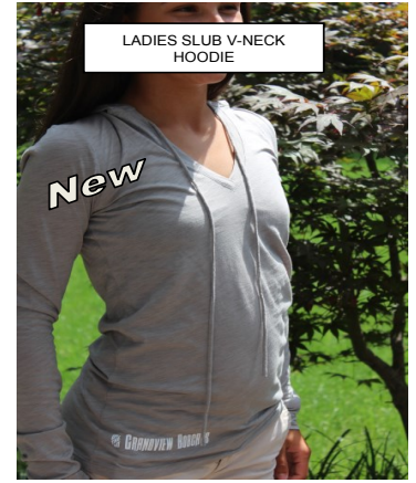
LADIES SLUB V-NECK HOODIE