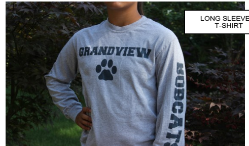
LONG SLEEVED T-SHIRT