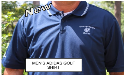
MEN'S ADIDAS GOLF SHIRT