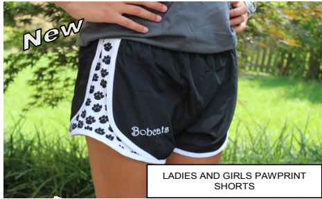
LADIES AND GIRLS PAWPRINT SHORTS