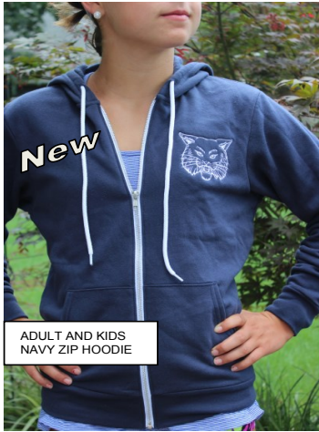
ADULT AND KIDS NAVY ZIP HOODIE