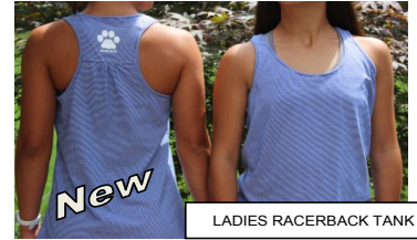
LADIES RACERBACK TANK