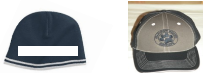
KNIT CAP AND BALL CAP