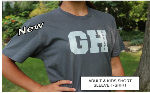
ADULT & KIDS SHORT SLEEVE T-SHIRT