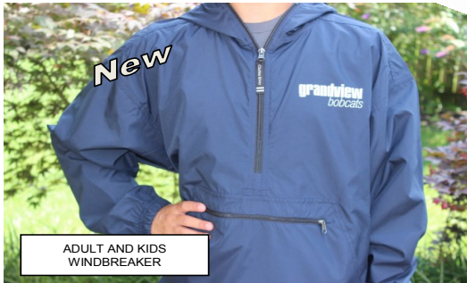
ADULT AND KIDS WINDBREAKER